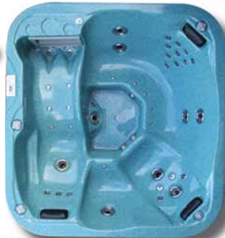
Above picture shows Neptune 3 pump system model

Dimensions: 2060mm x 1920mm x 870mm 81" x 75" x 34" approx.