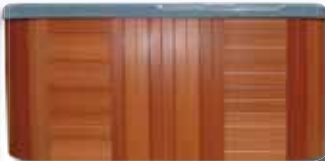
Deluxe Maintenance Free Cabinet