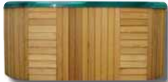
Traditional Red Cedarwood Cabinet

Models are supplied with a traditional red cedarwood cabinet as standard. However if you would prefer a maintenance free cabinet, then upgrade to our beautifully crafted polymer cabinet, with the rich, natural appearance of wood. The polymer material is durable, and does not need to be sanded down and treated each year.